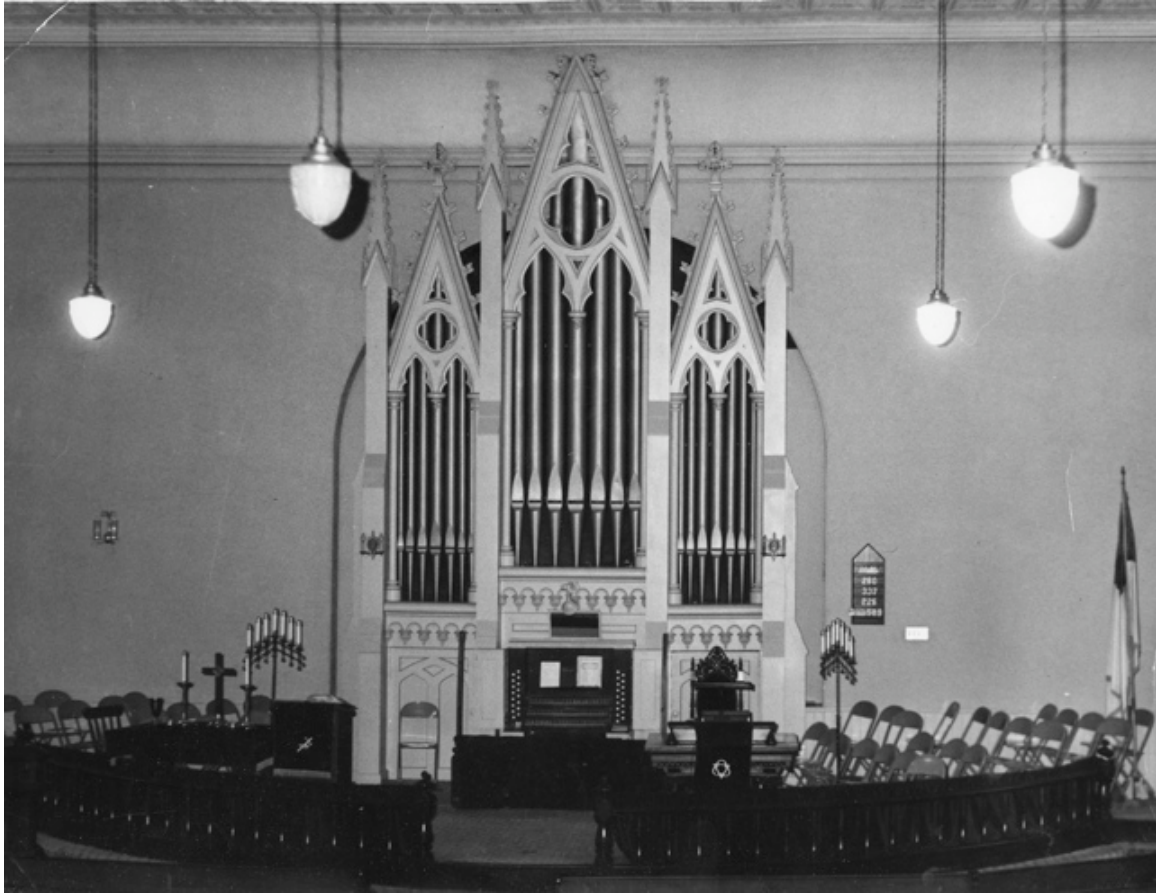
E. & G. G. Hook opus 173 1854. Photo circa 1963.