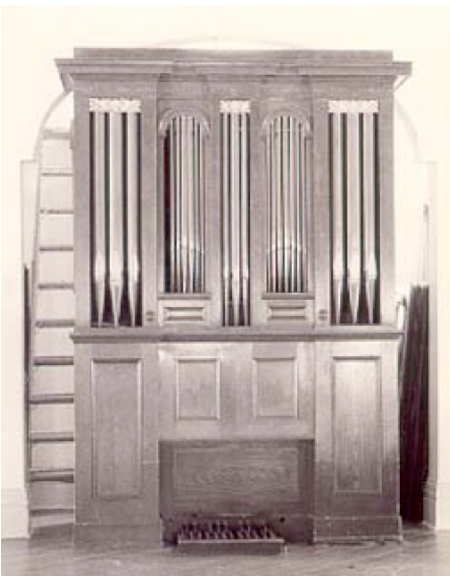
Approximate appearance of the reconstructed case.