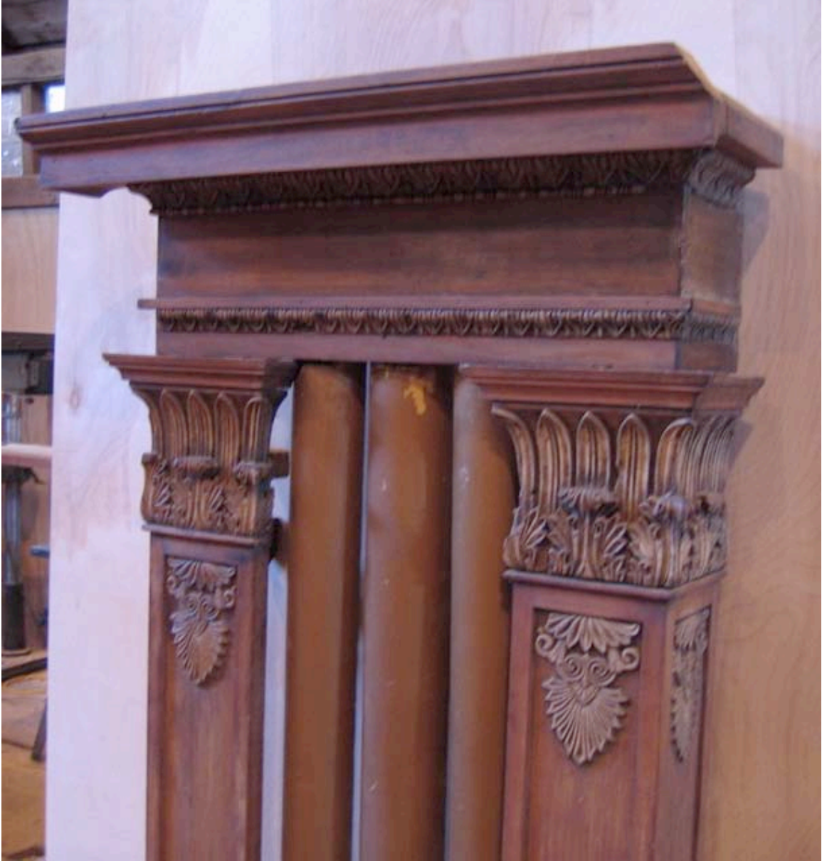
Old Simmons case in storage.